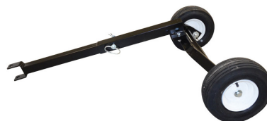
TLR-175 TRAILER MOUNT