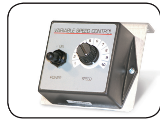
VAR-020 VARIABLE SPEED CONTROL Standard on TS300EG-1, Optional on TS300-1