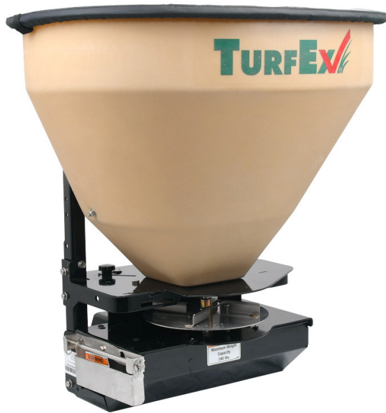
TS300-1 / TS300EG-1 (pictured) Tailgate Spreader