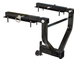
DRM-175-1 DROP UTILITY MOUNT